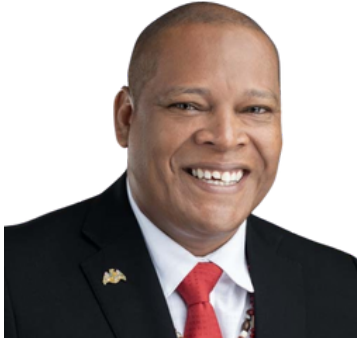
Hon. Minister Cozier Frederick

Minister for the Environment, Rural Modernization, Kalinago Upliftment and Constituency Empowerment, Commonwealth of Dominica.