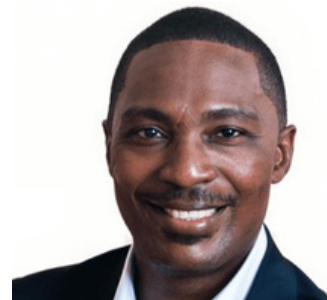
Hon. Minister Adrian R. Forde

Minister of the Environment and Natural Resources, Bahamas.