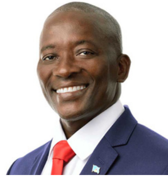
Hon. Minister Alfred Prospere

Minister of Agriculture, Forestry, Fisheries, Rural Transformation, Industry & Labour, St Vincent and the Grenadines