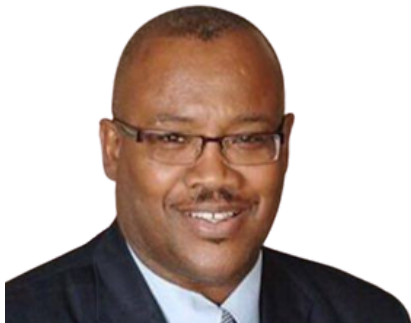
Hon. Minister Vaughn Miller

Minister for Agriculture, Fisheries, Food Security and Rural Development, St Lucia.