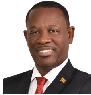
Hon. Minister Adrian Thomas

Minister for the Environment, Rural Modernization, Kalinago Upliftment and Constituency Empowerment, Commonwealth of Dominica.