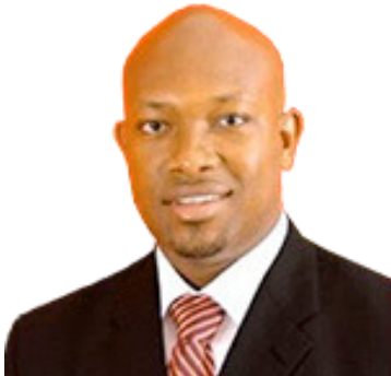
Hon. Minister Saboto Caesar

Ministry for Tourism, the Creative Economy, and Culture, Grenada.